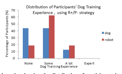
Fig. 3: A bar plot showing the distribution of participants in the third study who used the R+/P- strategy, based on their experience with dog training, grouped by the sprite they were training.