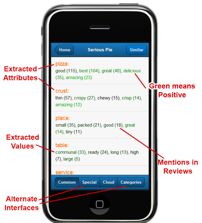
Figure 1: The REVMINER interface listing attributes and associated values extracted from Yelp reviews for the Serious Pie pizza restaurant in Seattle.

Copyright 2012 ACM 978-1-4503-1580-7/12/10...$15.00.