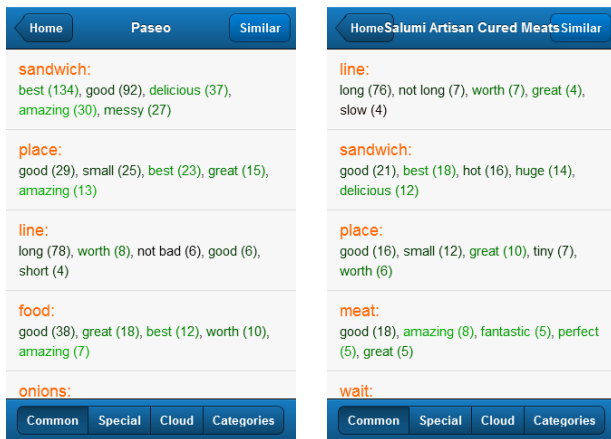
Figure 5: An example where two restaurants seem unrelated based on Yelp’s cuisine and price meta-data, but are noticeably similar when inspecting the finer-grained attributes extracted from reviews by REVMINER.

line” at Salumi; raving descriptions of the sandwiches and food at both restaurants, many mentions of the place being “small” as well as the seating being “limited” at Paseo and Salumi. From this, we can infer that these both attract lunch crowds where the long lines in front of small store with limited seating are worth the wait for delicious sandwiches. Thus, the metadata presented in the Yelp app’s search results page suggests there is little similarity between the two restaurants, but a deeper inspection by the similarity scoring system identifies a surprising similarity based on the extractions. Of course, REVMINER also performs well in common cases of finding similarity by typical attributes relating to cuisine, foods offered, service quality, etc.